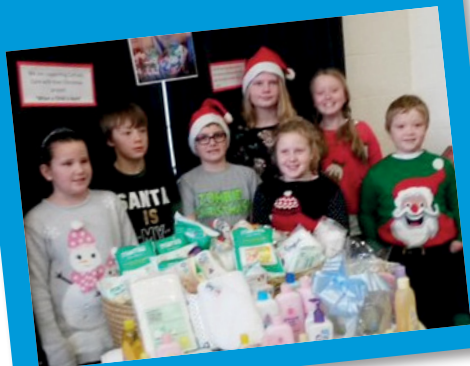
The children from St John the Baptist Primary School, Normanton. With their fabulous offerings for the Gianna appeal.

"People's generosity this year has been overwhelming, it really will make a difference to so many."